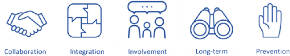
Figure 1: The 5 ways of working from the Well-being of Future Generations Act

Just as when we were preparing the Well-being Assessment, we have used the five ways of working, collaboration, integration, involvement, long term and prevention, to guide our work. This means that while considering how to improve well-being in our communities now, we've also looked at how well-being could be affected in the future and how we can prevent issues becoming worse. We will need to work together to see what we're each doing in a community and how this affects what we do, individually and in partnership. Finally, but most importantly, we want our communities, professionals, businesses and others to identify the issues which are most important to them.